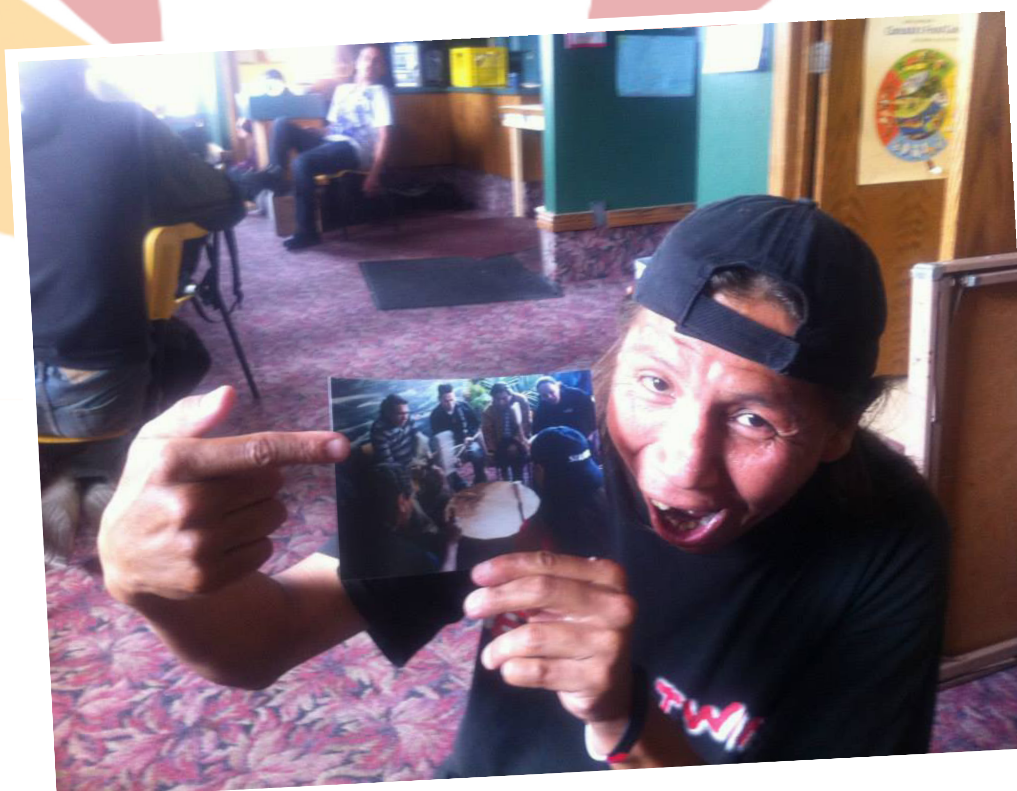
Photo albums were made from pictures that participants took with disposable cameras. Helped by a film student, activities included book binding and decorating.